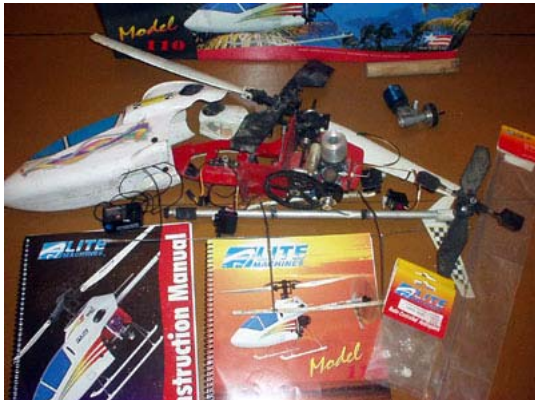
Here is the before shot